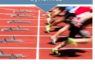
Rising market dynamics