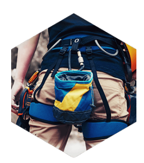
Spare Parts Management