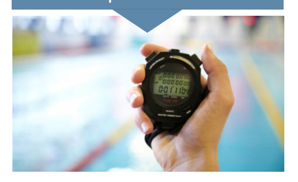
Higher performance expectations